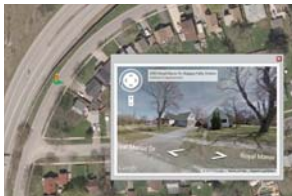
Google Maps™ with Street View™